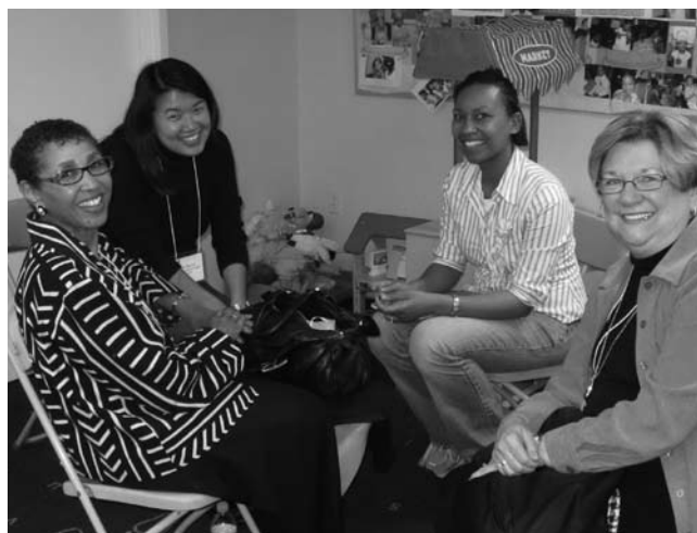
Nearly six hundred people attended the 10th Ethnic Ministries Summit in Boston.

Those attending the three-day Summit from April 15-17, 2010 had their choice of fifty-six seminar/track topics, including Building the Multicultural Church, Ministering to the Second Generation, Women in Intercultural Ministry, Understanding Cultural Openness to the Gospel, Muslim Outreach, and more. Forty-one people attended the two-day Pre-Summit Research Consultation and Training, during which they learned about both national and local examples of research regarding ethnic communities and church development. Additionally, eighty Bible school and seminary students earned academic credit