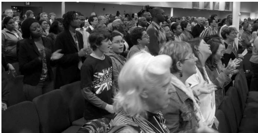
The Summit, sponsored by the Ethnic America Network (EAN), was based on Zechariah 2:4-5.